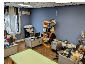
Northvale Building Dept. receives much needed makeover from DPW

The Northvale Ambulance Corps is in serious need of volunteers in order to keep this service free of charge and response times fast. No prior medical experience necessary. Anyone can join. You can email nvac226@gmail.com if interested. Make a difference in your community today!