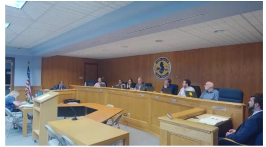
Meeting of the Mayor and Council - September 13, 2023

Can't make it to a Mayor & Council meeting? Just go to Northvale's YouTube channel and see the meeting live or watch previous meetings. Beginning with the 9/13 meeting, all M&C meetings are now livestreamed and recorded. Our residents deserve the transparency and convenience. Just go online to YouTube, search "Borough of Northvale" and hit the "subscribe" button. We'll see you online.