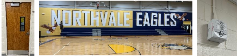
L to R: New Doors, New Wall Graphics, Upgraded Fire Alarm System

Our modular building, known as The Northvale Public School Annex, is in place. We are in process of completing both the exterior and interior of the building. The Annex will house our Preschool Program (beginning Sept, 2024) as well as our central admin offices (Superintendent, Business Administrator/Board Secretary, and our respective Administrative Assistants).