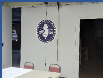
New Painted Wall and Seal at McGuire Senior Center