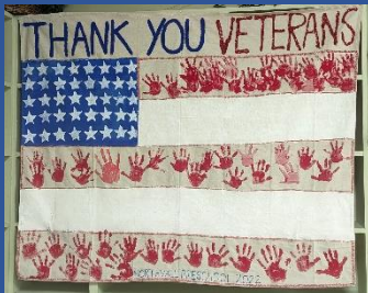
Flag Made by Northvale Preschoolers

Welcome to 2024! As we reflect on 2023 let's be thankful for the outstanding community in which we live. We recently honored our veterans on November 11 th , Veterans Day, with a ceremony outside of Borough Hall.